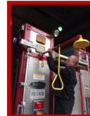
Side Mount Model